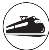
Train TGV station 10 minutes from the city center

Besides its international airport, Nice also has other modes of access. The city is connected to major French and international transport routes.