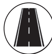
Roads A8 “La Provençale” Highway